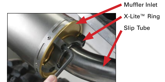
V.A.L.E.™ Assembly Detail